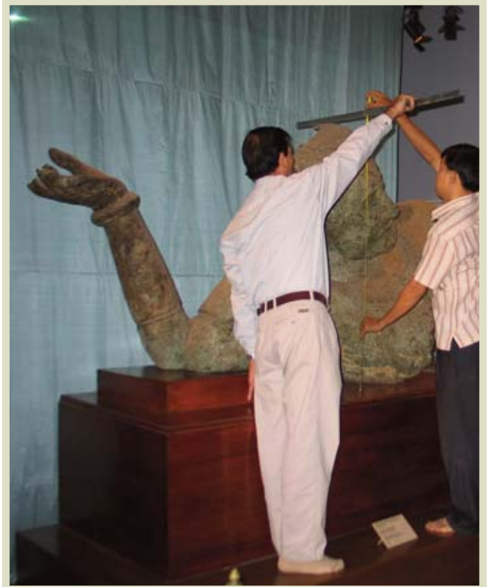
CIP team measuring the Reclining Vishnu on display in a museum gallery in 2010

"When the Museum officially opened on 13 April 1920, there were over 1,000 objects on display. Today the museum has approximately 14,000 objects and the collection is growing at a rate of over 300 objects per year. The majority of the collection is stored in a basement storage area. The project will bring together, and draw on, all existing registration methods used by the Museum at different times in the past, including several French card catalogue systems, Khmer handwritten inventory lists and a pre-existing-database. As part of the inventory and cataloguing project,