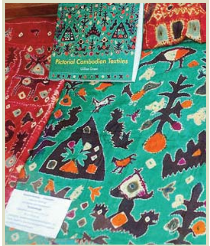
Display of textiles in the NMC collection, documented by the CIP team and subsequently used in Pictorial Cambodian Textiles , by Gillian Green (2008)

resources, The Museum is now in a strong position to present appropriate responses in such cases.