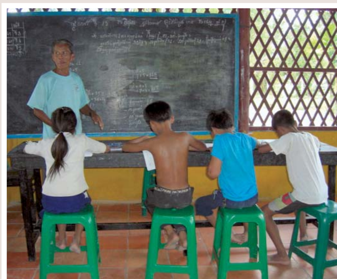
Class at orphanage

tribute to a greater understanding of not just the lives of Cambodian children, but the lives of the millions of chil-